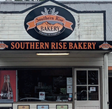
Southern Rise Bakery, Robertson